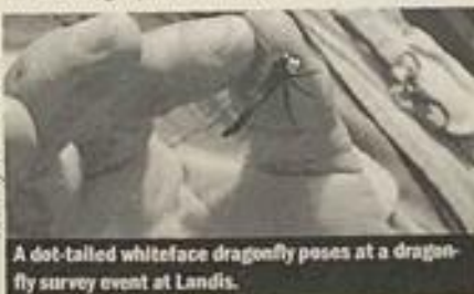
A dot-tailed whiteface dragonfly poses at a dragonfly survey event at Landis.

Please consider sponsoring one of our 2009 programs (or events) for as little as $250. In exchange, your company name will appear