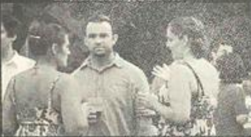
Happy guests enjoy cool beverages on a sunny summer afternoon