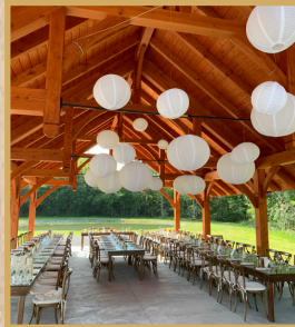
New outdoor pavilion

The Meeting House is a multi-use facility available for rental and is home to nature education workshops, musical events, and community gatherings. It is known for its "million dollar view" of the Schoharie Valley.