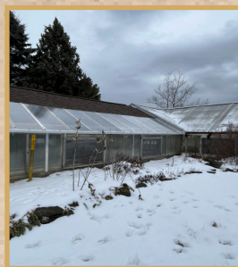
New roof on both the Library and Propagation Room

The Complex is the source of “Landis Grown” plants, best sellers at our plant sales. These buildings are instrumental for propagation work and horticultural education.