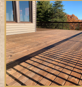
Deck and storage shed stained