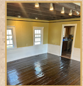
Painting and staining the boardroom walls and floors