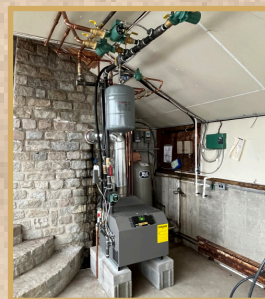
New furnace in the Propagation Room and moline heater in the Greenhouse