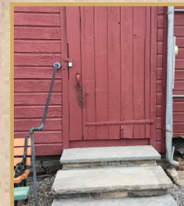
New stone stairs to the Bookstore