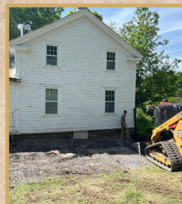
Energy efficient HVAC system and ductwork