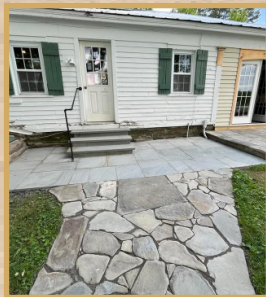
New stone patio and paths