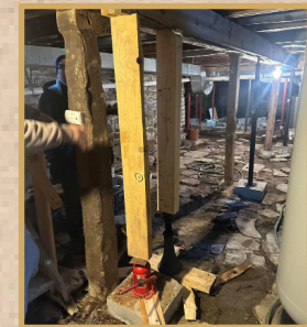
Replacing deteriorating structural beams