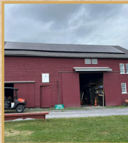
Solar panels installed

The Barn is used to store maintenance equipment. It also houses the Arboretum's used book store with its large and eclectic collection of books.