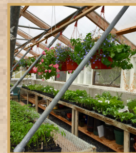
New polycarbonate panels installed in the Greenhouse